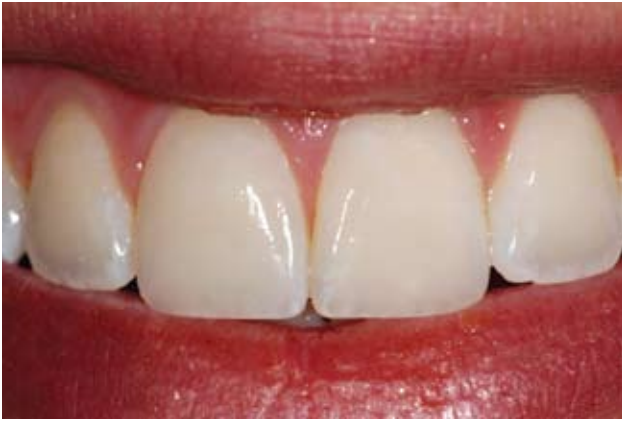
Figure 21: After whitening all her teeth, the final restorations were esthetically pleasing and exhibited characterization and polychromicity near the incisal edges.