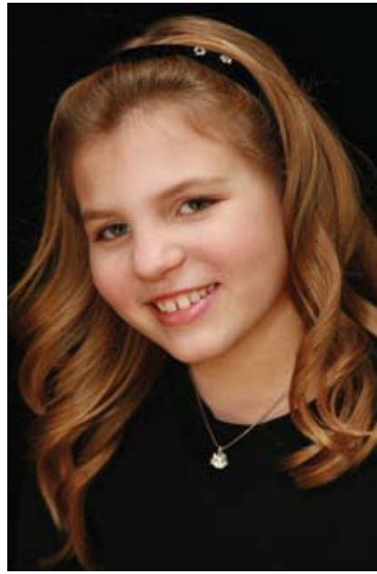
Figure 25: The patient was happy with her "new tooth" and pleased to smile naturally again.

layers of white tints. The final restoration was an acceptable replication of both the form and function of the natural central incisor (Figs 24 & 25).