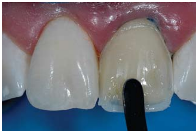
Figure 11: After clear composite was placed in between the mammelons and cured, an enamel layer of high-value composite was placed and slightly under-contoured.