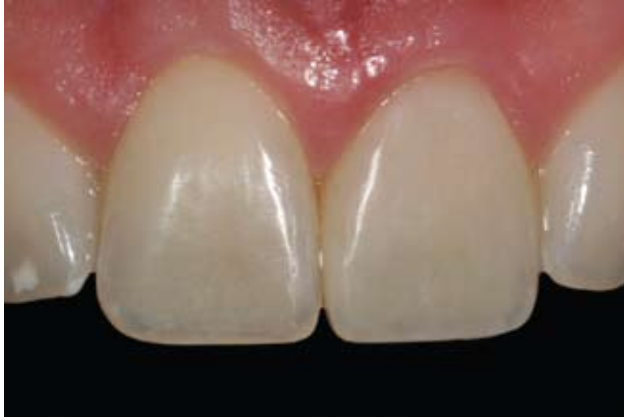
Figure 17: The final restoration demonstrated acceptable esthetics and correct protrusive function with the orthodontically corrected lower incisors.