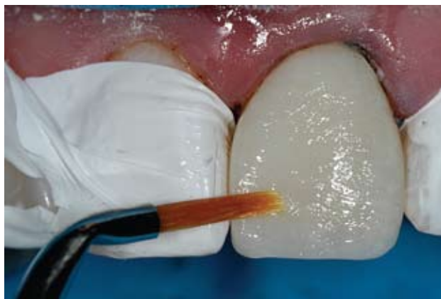
Figure 12: White tint was placed with an artist's brush and then streaked with an endo file to create internal areas of hyper-calcification and characterization.

enamel and is responsible for light scattering in the natural dentition. 12