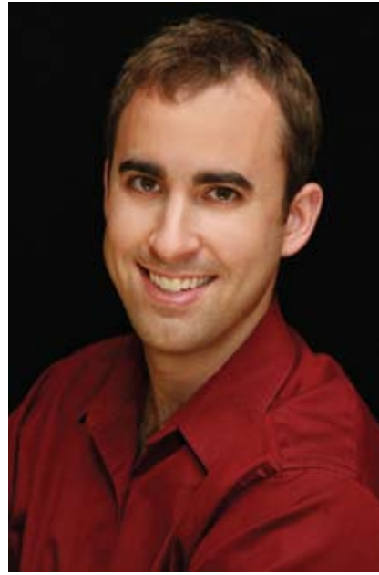
Figure 18: The patient's final esthetic restoration was in harmony with his natural smile.