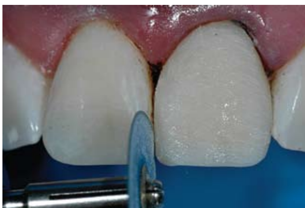
Figure 15: Initial finishing was accomplished using coarse and medium finishing discs to create gross incisal, interproximal, and facial contours.