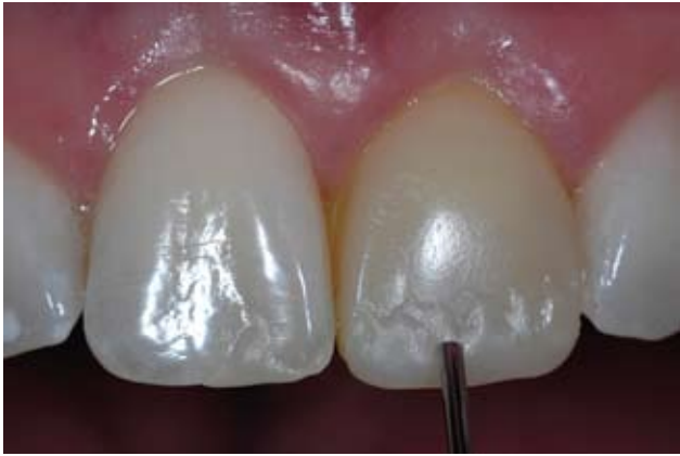
Figure 3: A mock-up was completed using flowable composite to establish the incisal length and contours prior to fabrication of the putty matrix.