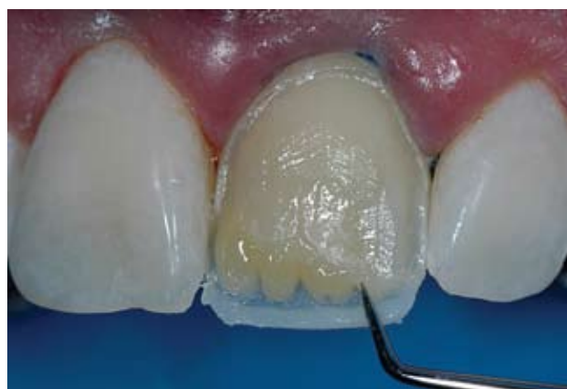
Figure 10: The dentin layers were placed to replicate the lost dentin tooth structure. Mammelons were formed using a sharp instrument.

component bonding agent (One Step, Bisco) was applied with a microbrush (Microbrush; Grafton, WI) in multiple coats using a light scrubbing motion (Fig 6). The area was thoroughly air-dried until all excess adhesive and solvent were removed. The adhesive was light-cured for 40 seconds (Fig 7) with an UltraLum curing light (Ultradent).