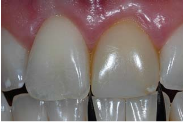
Figure 1: The patient desired improved esthetics of his upper left central incisor. Note that the width of the centrals was measured for symmetry.