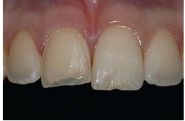
Figure 20: Removal of the existing composites revealed a large Class IV fracture extending near the gingival margin on the right central incisor.