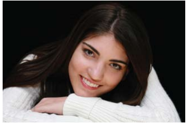
Figure 22: The patient was very pleased with the final results and the overall enhancement of her smile.