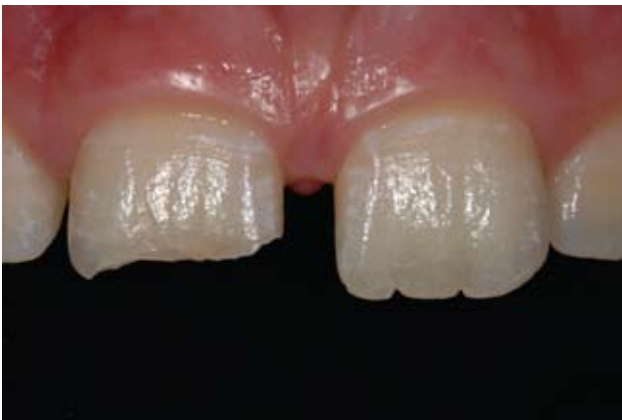
Figure 23: The right central incisor was fractured horizontally in an accident but retained vitality.