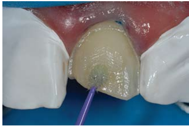
Figure 6: Plumber's tape was used to protect the adjacent enamel. After etching and rinsing, a single component adhesive was placed in two coats.