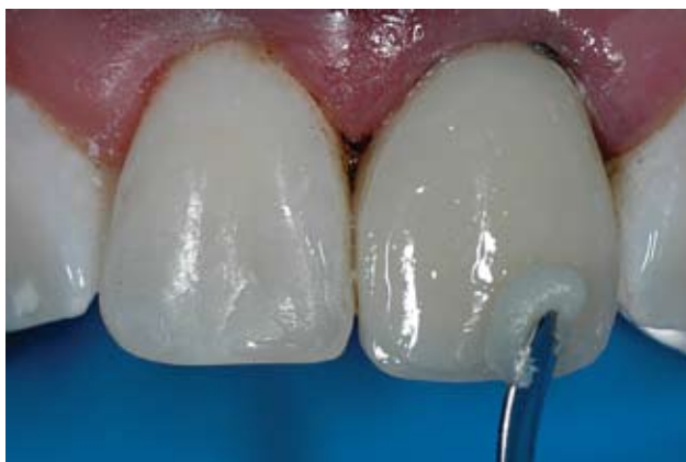
Figure 13: A thin layer of clear enamel composite was placed and slightly over-contoured to allow for finishing.