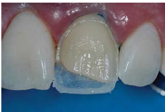
Figure 9: A high-value white composite was added to the incisal edge to create an incisal halo at the predetermined length.