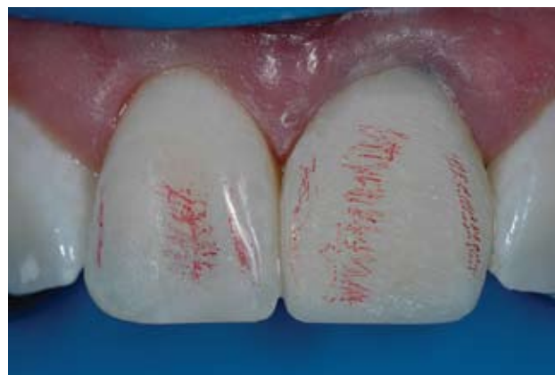
Figure 14: Line angles and contours mimicking the adjacent central incisor were marked with a red pencil.