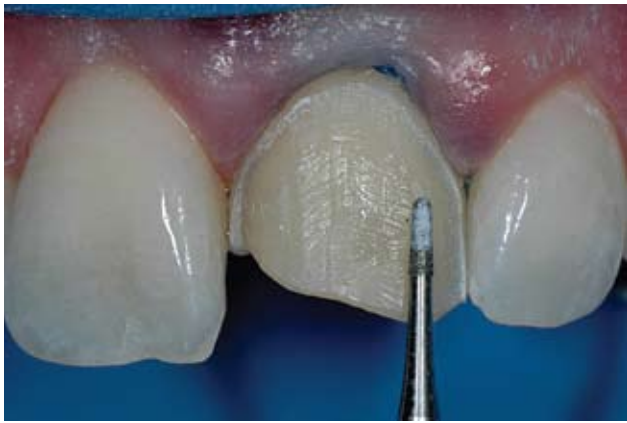
Figure 5: The existing restoration was removed and the preparation smoothed with a fine diamond. A 45° bevel was placed at the fracture line.