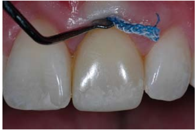
Figure 4: Retraction cord was placed to retract the gingival tissue and prevent infiltration of the adhesive subgingivally and onto the root surface.