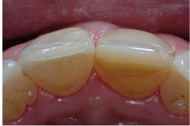
Figure 2: Contours viewed from the incisal aspect reveal that the existing restoration had asymmetrical contours on the buccal and lingual that contributed to deficient esthetics.

conservative in nature and do not follow the historic GV Black preparation designs.