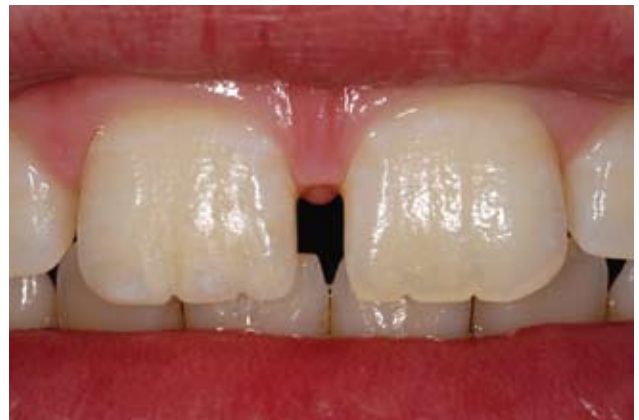
Figure 24: The conservative Class IV composite restoration did not require the removal of any additional tooth structure and was esthetically acceptable.