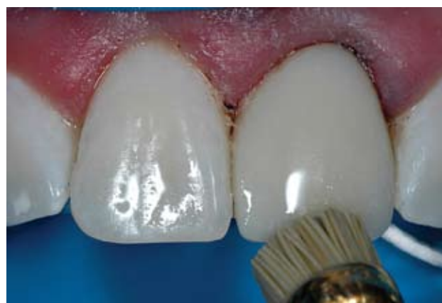
Figure 16: A Jiffy brush with water was used at low speeds to polish the restoration after fine diamonds, rubber cups, and points had been used.

mond to impart horizontal scratches and contours. Care was taken to replicate the facial surface of the adjacent teeth and the original anatomy presented. Optimum visualization of the reflective and deflecting zones ideally can be achieved by placing gray artist's glitter over the facial surfaces. The glitter accentuates the minute changes in light refraction and allows for slight corrections in contour.