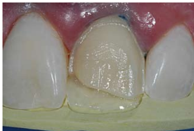
Figure 8: A thin layer of milky white composite was placed in the putty stent to form the lingual enamel shelf and light-cured.